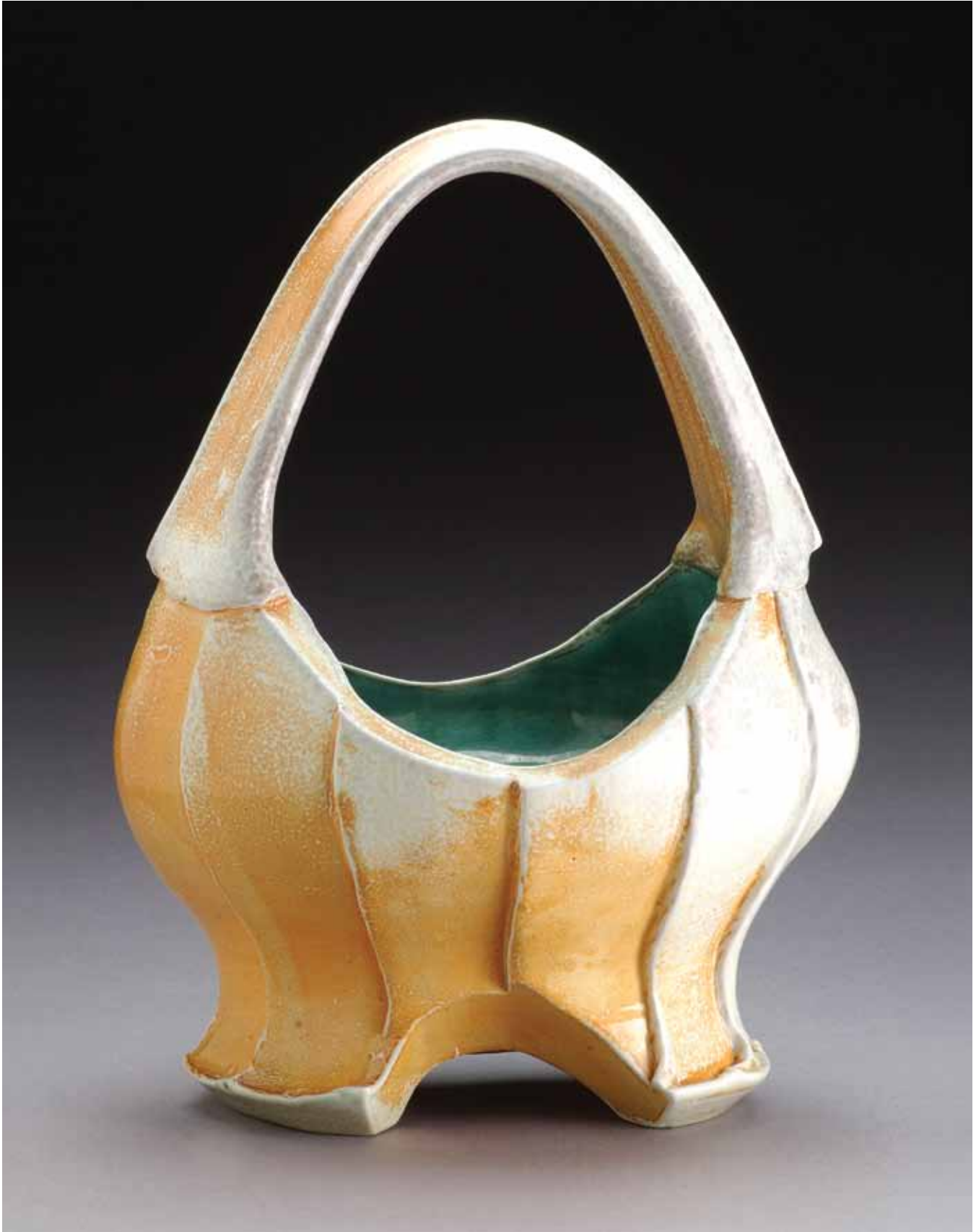
"Fruit Basket," 10 in. (25 cm) in height, thrown, altered into an oval and fluted on the wheel, dipped in flashing slip when leather hard, single fired to Cone 10 in a soda kiln.