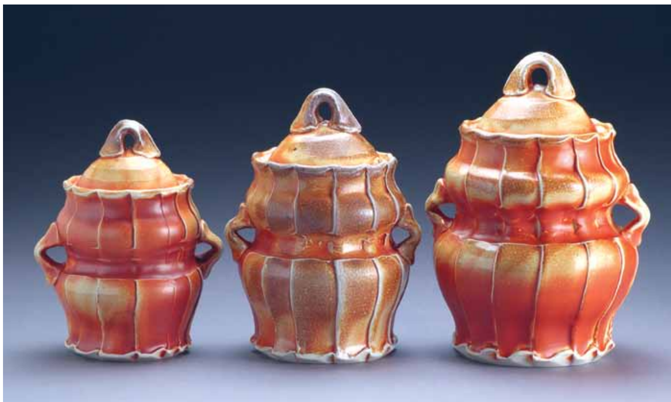
Canisters, to 11 in. (28 cm) in height, thrown porcelain, fluted, with added pinched handles, dipped in flashing slip when leather hard, single fired to Cone 10 in a soda kiln.

Useful she was. Not only did she create functional work for the community, she also served as a frequent instructor, working with residents, visitors and children. “I thoroughly enjoy teaching,” she