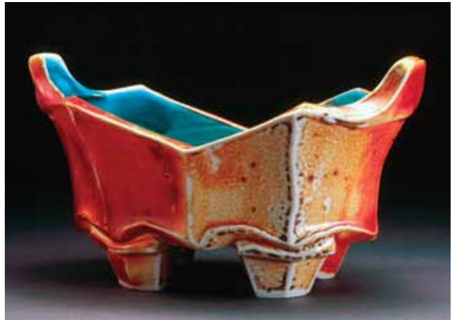
"Centerpiece Bowl," 8 in. (20 cm) in height, thrown and faceted porcelain, with slip and glaze, single fired to Cone 10 in a soda kiln, 2002. "I imagine that exaggerating certain aspects of the pots is a way to make them more interesting, hence the handles at the end of this piece exaggerated the oval form, and the feet and cut rim enhance this effect too," said Smith.

"I believe that a hunger for tactile knowledge and experience feeds the contemporary popularity of using and making pottery," she