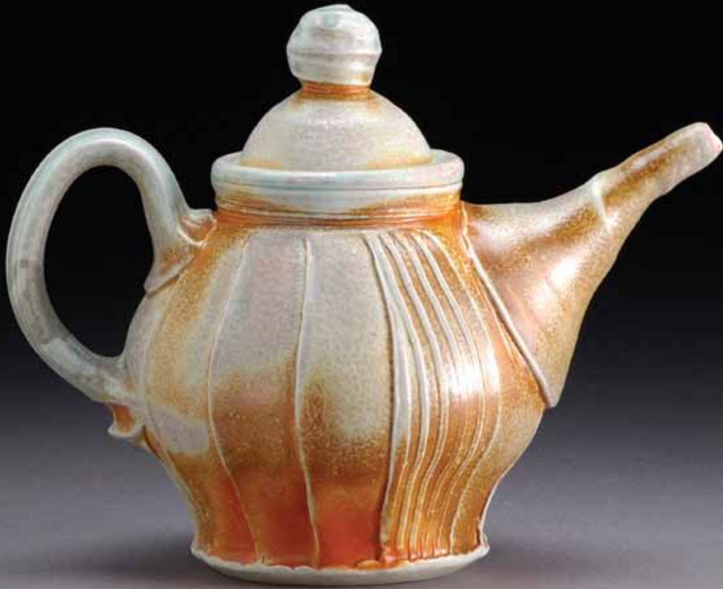
Above: Fluted Teapot, 6 in. (15 cm) in height, thrown porcelain, fluted on the wheel, dipped in flashing slip when leather hard, single fired to Cone 10 in a soda kiln. Below: Hourglass Bowl, 7½ in. (19 cm) in height, thrown porcelain, altered and fluted on the wheel, with handbuilt feet and handles, glaze dipped and poured while leather hard, single fired in a soda kiln to Cone 10, by Gay Smith, Bakersville, North Carolina.